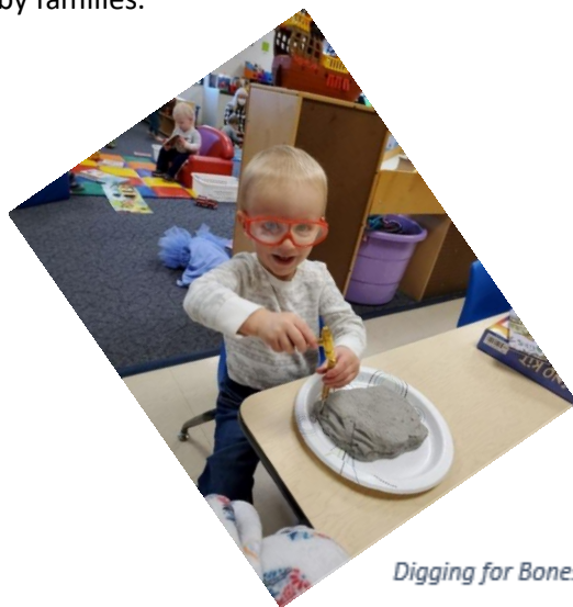
Digging for Bones in Wiggles