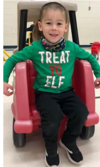
Indoor fun in the gym